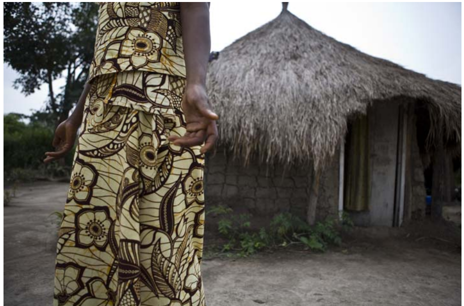
One of the 1.7 million displaced people in DRC in front of her home at an IDP camp in Province Orientale.

Each year Oxfam undertakes a far-reaching survey of unheard, conflict-affected people in eastern Democratic Republic of Congo. Three-quarters of the 1,705 people polled in 2011 said that they felt their security had not improved since last year. In areas affected by the Lord's Resistance Army (LRA), this figure rose to 90 per cent, with communities telling Oxfam that they felt abandoned, isolated, and vulnerable. Communities everywhere painted a grim picture of continued abuse of power by militias, the Congolese army, and other government authorities, wearing away their livelihoods and ability to cope.