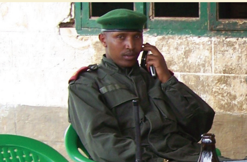
Bosco Ntaganda: Nkunda's chief of staff and indicted war criminal.

Disturbingly, Bosco "The Terminator" Ntaganda, a known hardliner within the CNDP and a wanted war criminal, was filmed by international news crews in Kiwanja on November 5. Ntaganda, Nkunda's chief of staff, has kept a low profile since April 2008, when the International Criminal Court, or ICC, unsealed an arrest warrant for alleged conscription of child soldiers in Ituri Province. However, a few days after his appearance in Kiwanja, Ntaganda was reportedly seen crossing the border from Rwanda into Congo. He was also present in Rwanguba when the Enough Project visited with Nkunda and other CNDP officials on November 27. The conspicuous presence of an indicted war criminal in North Kivu is another grim reminder of the state of impunity that fuels the conflict and casts serious doubts on the CNDP's commitment to a political solution.