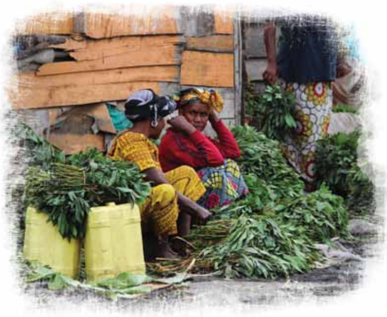
Military wives seek to supplement their income with small-scale trade in the local markets. "We have to beg for support from our acquaintances. The government does not support us at all," said one soldier.

confrontational attitude on the part of the international community could cause an unhelpful political backlash – managing tensions will require astute and fleet-footed diplomacy, and a leading role to be played by African actors. But equally, no one should be under any illusion as to difficulties that will need to be faced – there is no magic bullet to security sector reform in the DRC. It needs sustained political commitment above all. There will be disagreements, with Congolese Government, and between elements of the international community. Such a push will need sustained, high-level political commitment, and must be backed by real conditions.