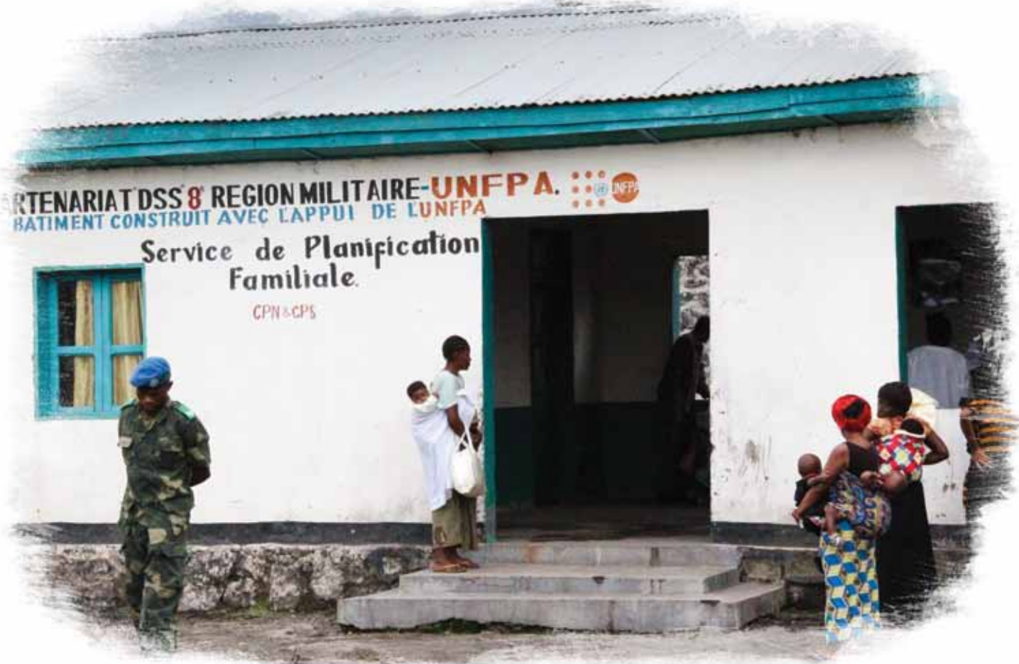
The rudimentary hospital in the camp provides basic medical services to military families.

ARTENARIAT DSS 8 REGION MILITAIRE-UNFPA. BATIMENT CONSTRUIT AVEC L'APPUI DE L'UNFPA Service de Planification Familiale. CPN & CPS