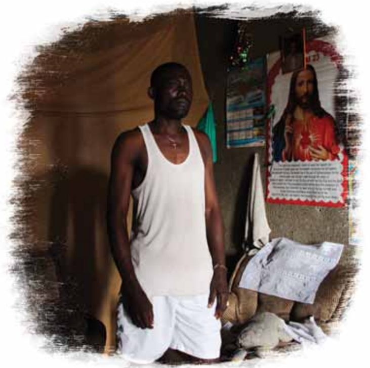
A soldier at home in his barracks, Katindo Camp, Goma.

45. The EUSEC project on reform of the Congolese military demonstrates that structural reform need not be expensive if support is correctly targeted. EUSEC was launched in 2005 and embedded small numbers of European officers at senior levels in both headquarters and with individual units. Designed to offer strategic advice and targeted support, its most significant initiatives have been working on the 'chain of payments' –